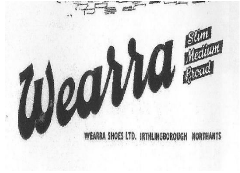
Irthlingborough's Shoe Industry