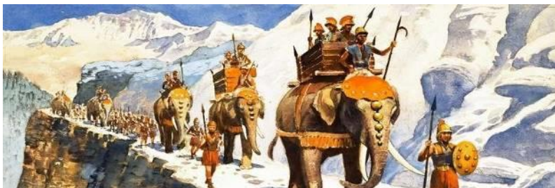
Hannibal and Elephants