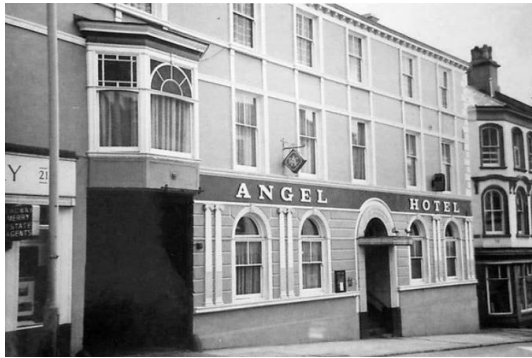
The Angel Hotel, Story of an Eyesore