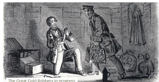
The Great Gold Robbery in progress