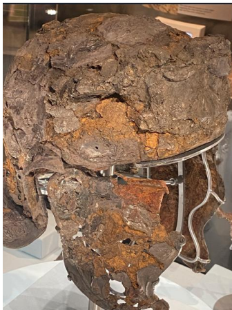
The Roman Helmet of Hallaton