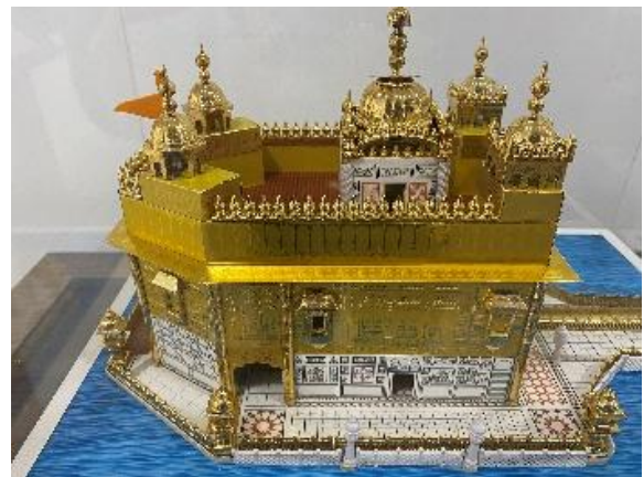
Northampton Sikh Museum