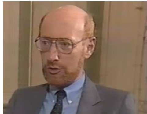
Sir Clive Sinclair