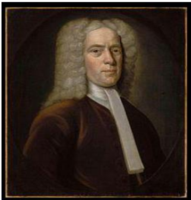
The Quincy's of Northamptonshire