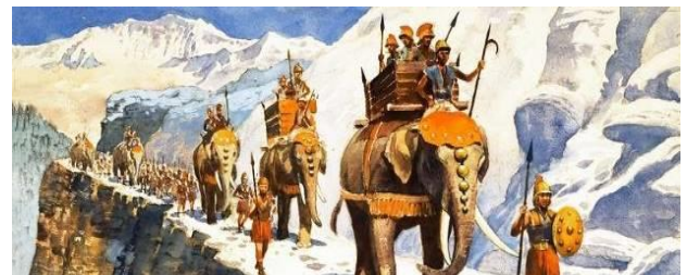
Hannibal and Elephants

One of the first images of Becket made after his canonisation is this mosaic in Monreale, Sicily, which could have been based on information about Becket from Henry II's daughter and Becket's own nephew, who both lived there. He is shown holding a small jewelled book... but so are other saints in the cathedral.