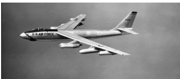
The Cuban missile crisis and Northamptonshire