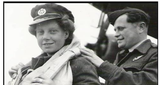
The Flying Nightingale of Wellingborough